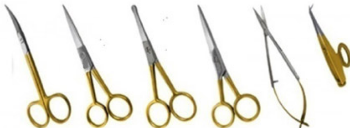
KI-330 KI-331 KI-332 KI-333 KI-334 KI-335