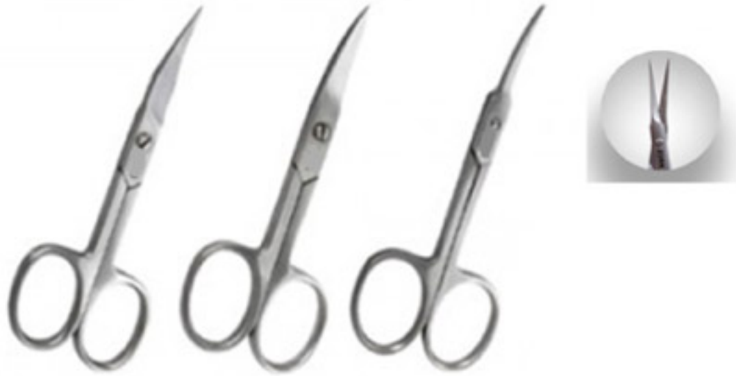
KI-316 KI-317 KI-318