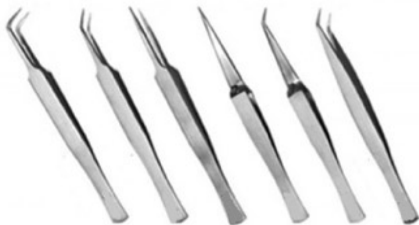
KI-036 KI-037 KI-038 KI-039 KI-040 KI-041