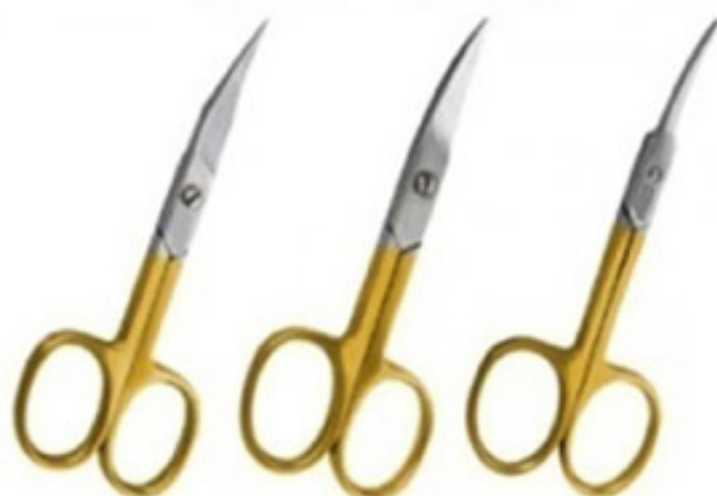
KI-327 KI-328 KI-329