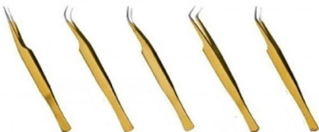
KI-042 KI-043 KI-044 KI-045 KI-046