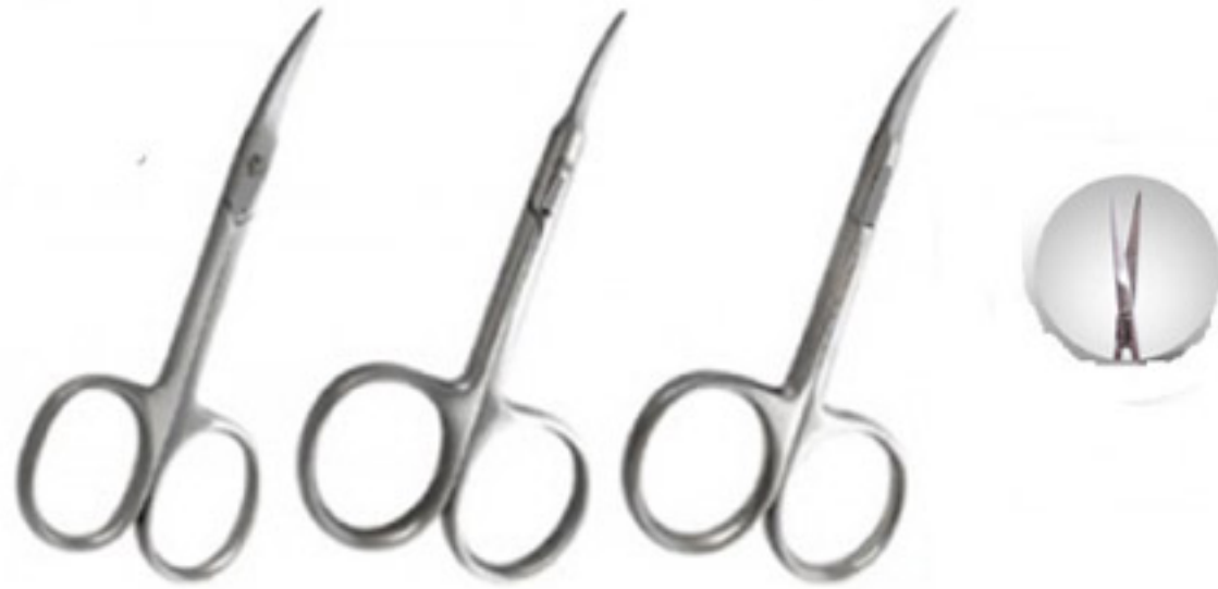
KI-319 KI-320 KI-321