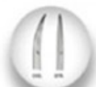
KI-327a KI-328a KI-329a