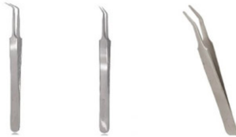
KI-223 KI-224 KI-225

Designed for precision and comfort, SugarLash™ PrecisionTweezers are your best choice for high quality, high precision stainless steel tweezers specially designed for Professional Lash Stylists