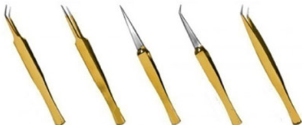
KI-047 KI-048 KI-049 KI-050 KI-051