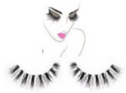
KI-279 KI-280 KI-281 KI-282 KI-283 KI-284 KI-285 KI-286 KI-287 KI-288

Tweezer 001 was designed for eyelash extensions. This straight tweezer is used for picking up and placing an eyelash. This is made of premium quality stainless steel. Precision calibrated tips with good grip to pick up and place down eyelash extensions with ease. Achieve exact placement of lashes with this precise Tweezers., Featuring a super-fine tip for ultimate precision, and equal taper on both sides for ease of use. The soft spring is designed to reduce hand fatigue. Non-magnetic, Non-static, Autoclavable. Super-fine tip, Stainless Steel.