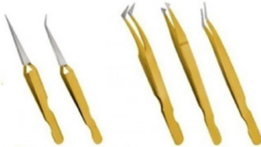
KI-059 KI-060 KI-061 KI-062 KI-063