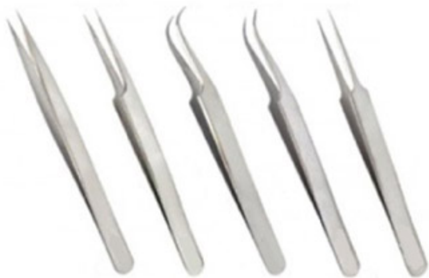
fig-1 fig-5 fig-7a fig-7 fig-4