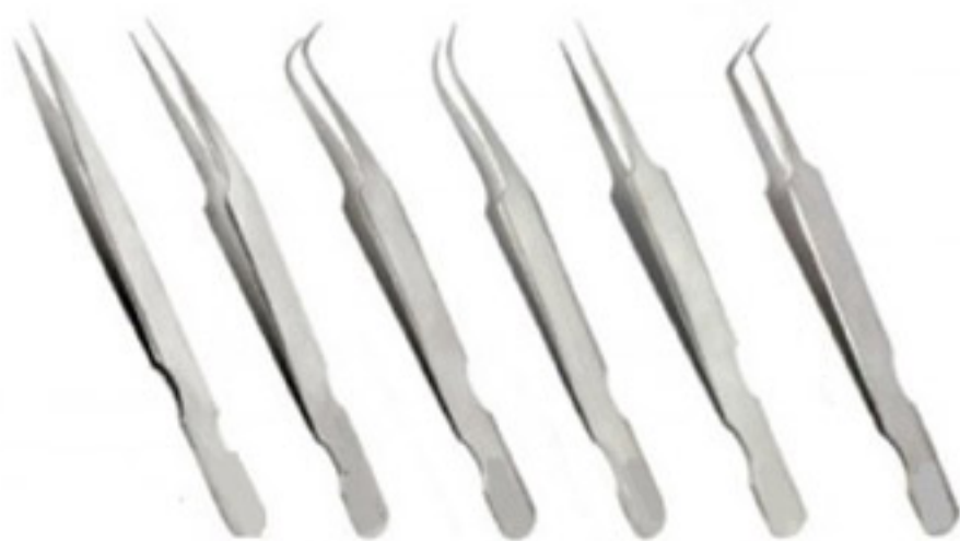
KI-018 KI-019 KI-020 KI-021 KI-022 KI-023