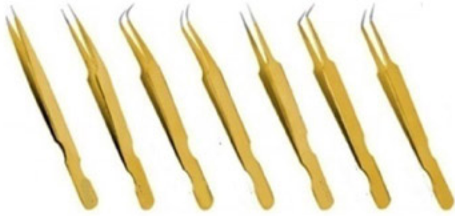
KI-052 KI-053 KI-054 KI-055 KI-056 KI-057 KI-058