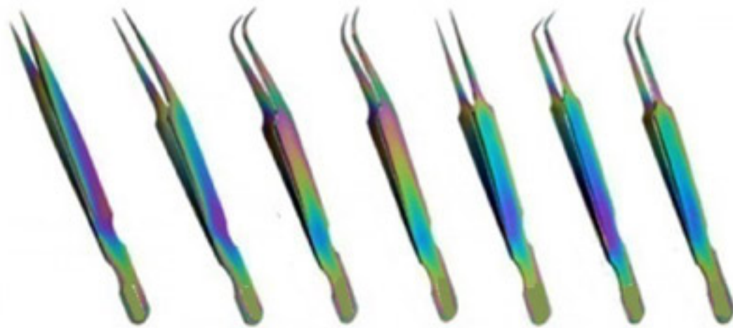
KI-064 KI-065 KI-066 KI-067 KI-068 KI-069 KI-070