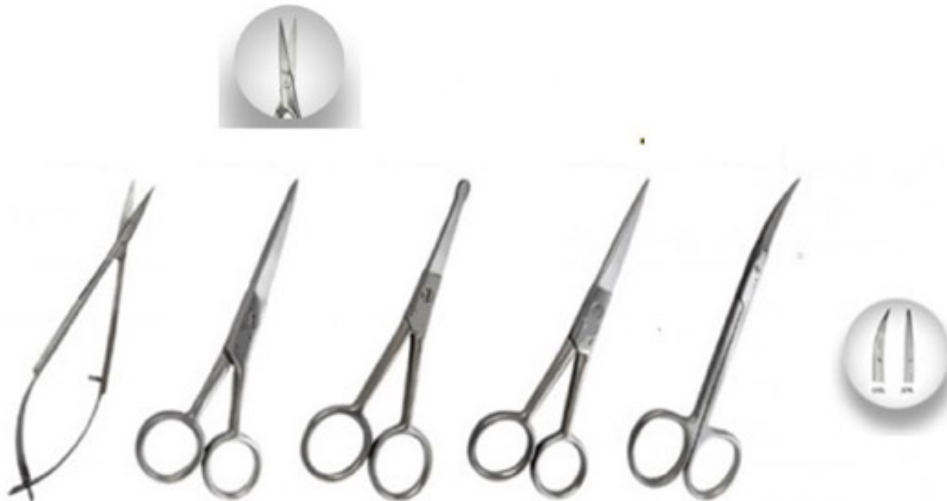
KI-322 KI-323 KI-324 KI-325 KI-326