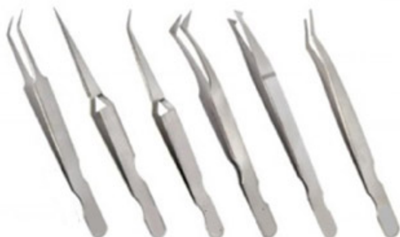
KI-024 KI-025 KI-026 KI-027 KI-028 KI-029