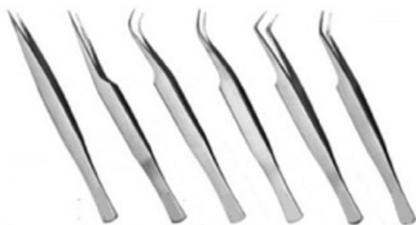
KI-030 KI-031 KI-032 KI-033 KI-034 KI-035